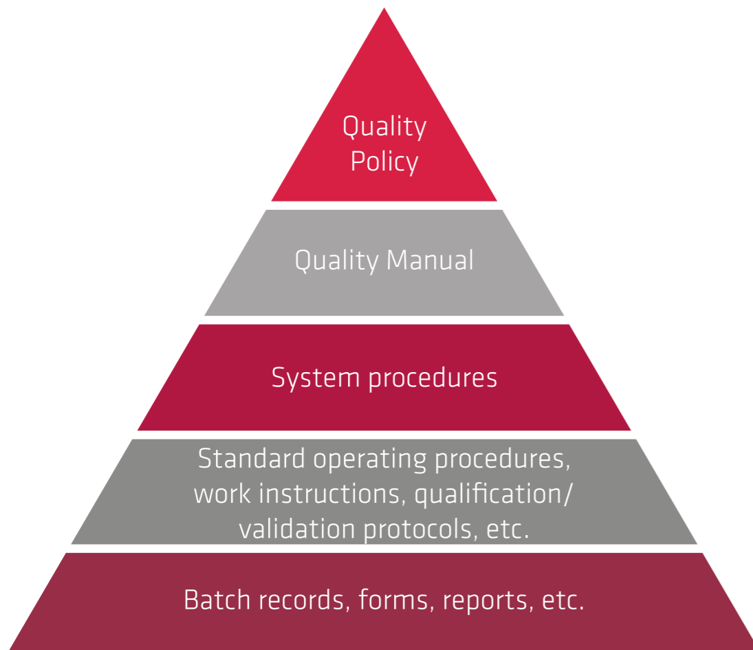
Pyramid structure of the Antibiotice's Quality Management System

Our quality, environmental, occupational health and safety standards are strictly met through rigorous policies and procedures. These procedures are periodically revised and improved, in accordance with the specific EU-GMP and ISO requirements.